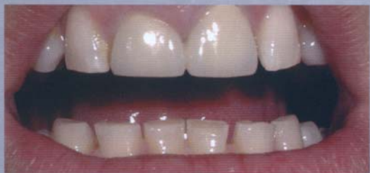
Bruxism can wear down and destroy your teeth.

D oes your jaw feel stiff or do you have difficulty opening your mouth wide? Are your teeth sensitive to cold drinks? Do your jaw muscles feel tired in the morning? You may be grinding your teeth at night (a medical condition called bruxism) or you may be clenching your teeth, which can be just as harmful. People with nighttime grinding habits may wear away their tooth enamel "ten times faster" than those without "abusive chewing habits." 1 Eventually, your teeth may be worn down and destroyed.